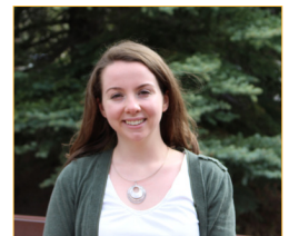
Alexis Klein Health Coverage Guide